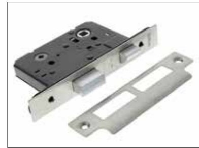
Bathroom Lock - 5230