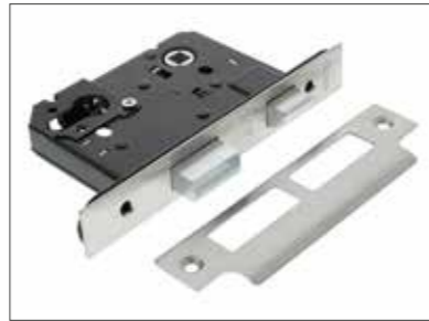
Sashlock - 5220