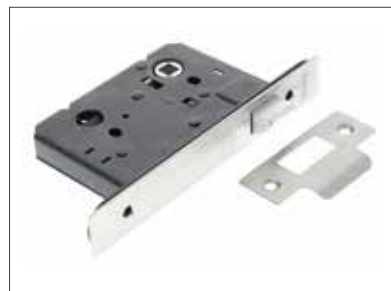
Latch - 5240

* Deadbolt can be withdrawn from one side or both sides depending on the type of cylinder selected.