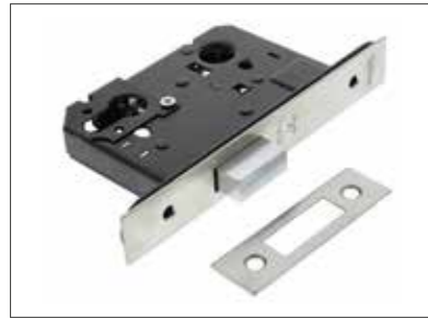
Deadlock - 5210