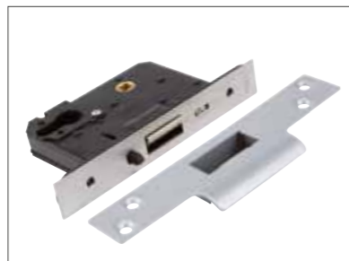
Nightlatch - 5250