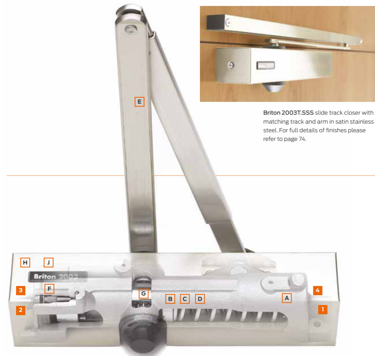
Briton 2003T.SSS slide track closer with matching track and arm in satin stainless steel. For full details of finishes please refer to page 74.

The adjustable power 2003V provides the flexibility to 'fine tune' the closing power of the door control in order to achieve the low 'opening forces' necessary to satisfy the requirements of Approved Document M of The Building Regulations and the guidance of BS 8300 in relation to The Equality Act (2010).