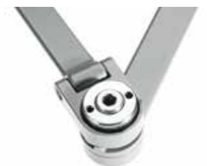
Mechanical hold-open armset