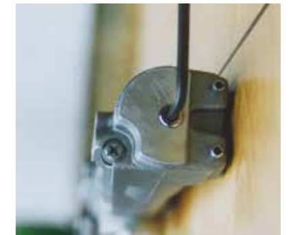
Briton 2003V power adjustment