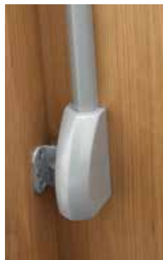
Lower Side Pullman