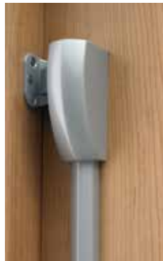
Upper Side Pullman